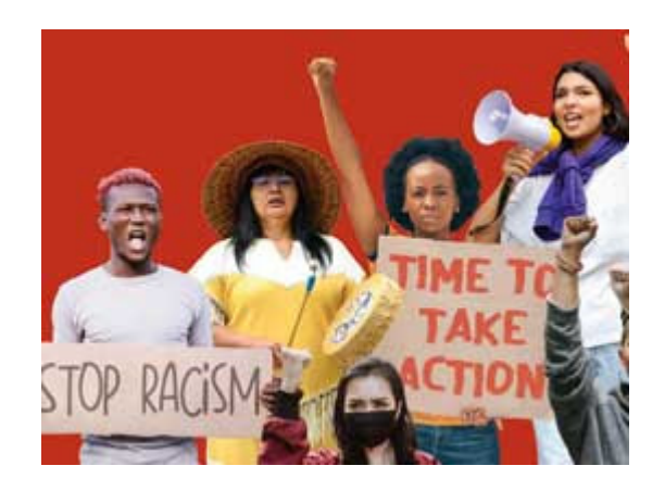
March 21 is the International Day for the Elimination of Racial Discrimination. Read our statement.