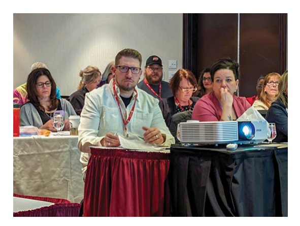
Unifor's recent long term care conference brought together a diverse group of Ontario members united by a common bargaining goal.